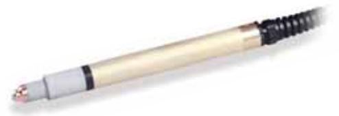
T80M machine torch