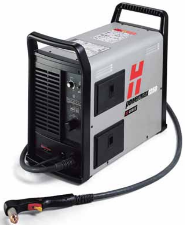
T80 hand torch