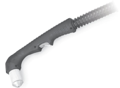
PAC200T hand torch