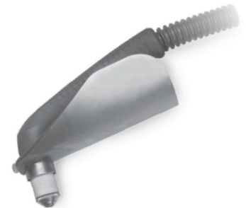
PAC200E gouging torch